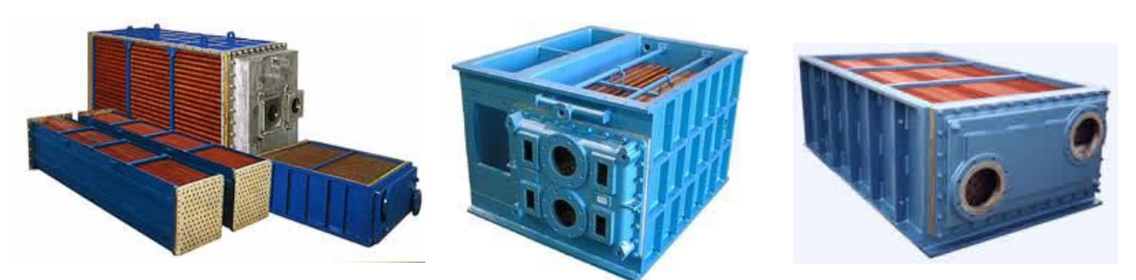
Figure 1 Some examples of finned block coolers:

Water-air heat exchangers where the primary fluid is air and the secondary is water are manufactured in two main designs which are the finned block and the shell and tube designs.