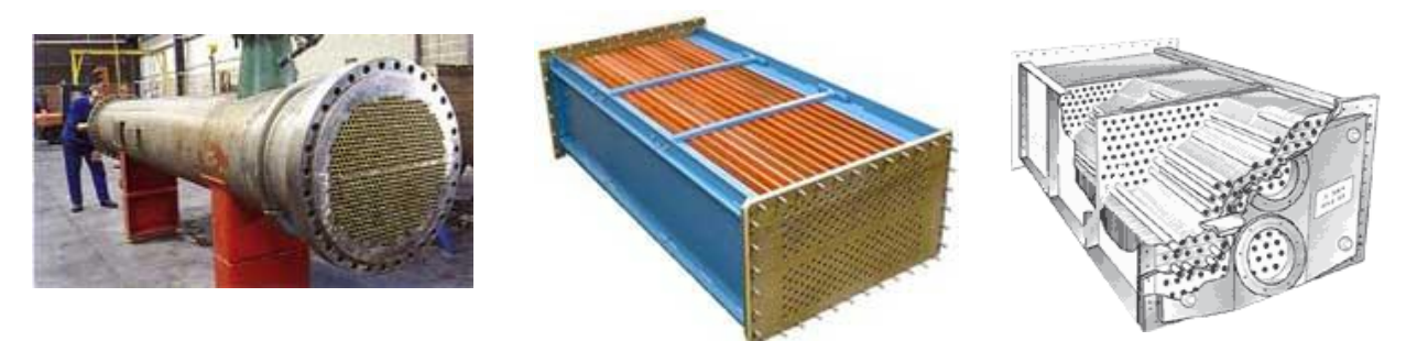
(Figure 2) A Typical shell and tube cooler